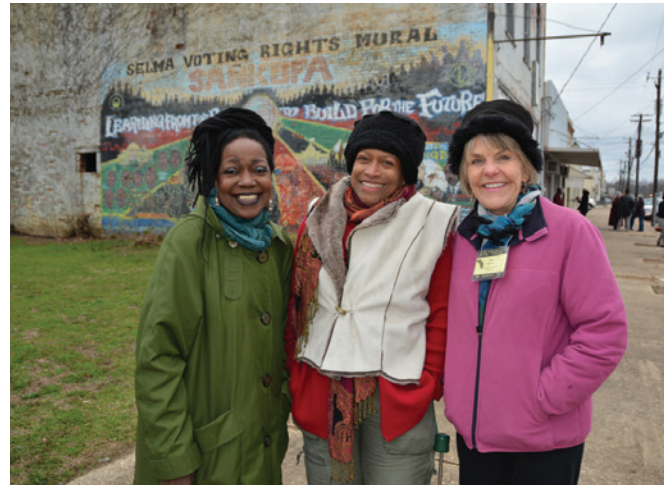
2015 Living Legacy

Seed funding for a media project that will create, support and disseminate original and engaging video content to attract, engage and retain youth and young adults to Unitarian Universalism.